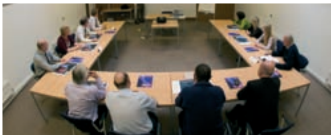
Our Burn Hall Training Facility

Maintaining a building and its facilities in accordance with ever changing technical legislation, means Facilities Managers and Building Services Engineers alike, require on ongoing update of various competency qualifications. Develop Training Ltd has put together a suite of training courses that keep staff up to date with the latest regulations in a wide range of disciplines.