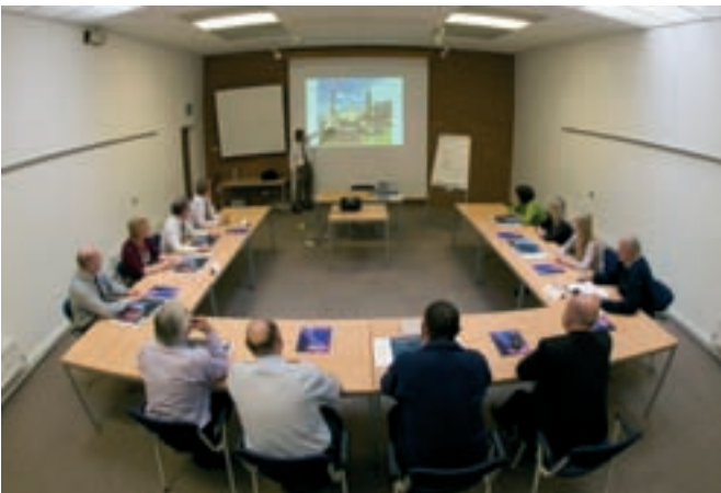
Our Burn Hall Training Facility

The technical complexity of hospitals means that their staff need to be trained to a high standard across a wide range of disciplines. To help meet these needs, Develop Training Ltd has put together a suite of courses for Health Estates training suitable for the NHS and other healthcare organisations.